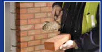
Step 4 Standard bricks are continued until the next detail is required