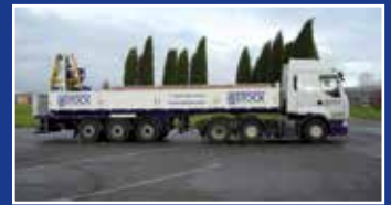
Step 1 Units are delivered to site ready for installing