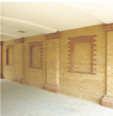
Contrasting Special Shapes giving the brickwork an attractive feature.

However, if complimentary rather than contrasting specials are required, early consultation with the manufacturer will help clarify requirements and expectations.