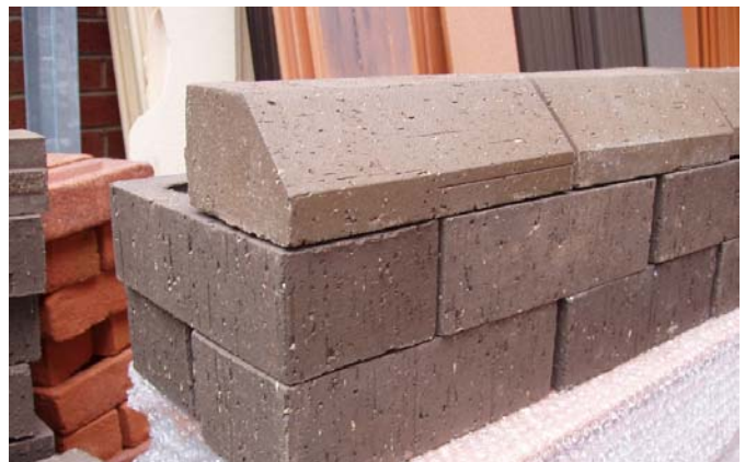
Due to different extrusion processes, the drag wire marks on the plinth bricks run horizontal whilst the standard bricks are vertical.

When brickwork is viewed from the standard minimum 3m distance, differences between the methods of manufacture should not be noticeable.