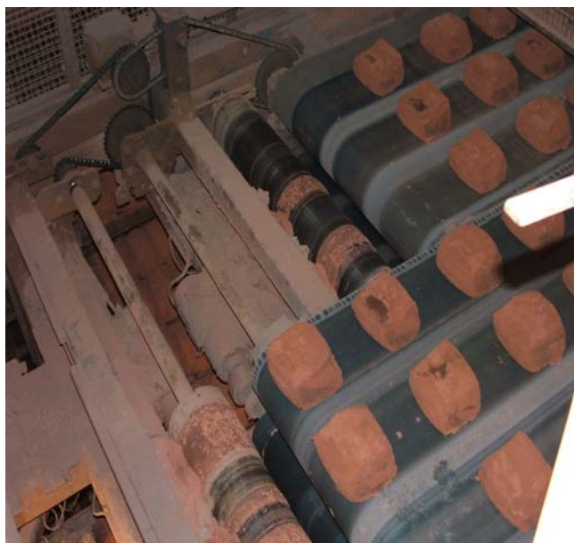
Clots of clay being mechanically thrown into moulds.

For standard bricks large automated machines can replicate the hand-making process much quicker by using banks of mould boxes continually on a circuit where the boxes are washed, sanded, filled with pre sanded clots of clay, struck off level and the formed brick turned out.