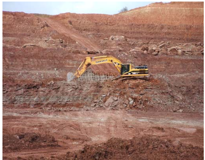
Clay being extracted from a quarry by a mechanical digger.

The advantages of bulk winning are that it can take place during good weather, a large reserve close to the factory means that breakdown of quarry plant is not critical to the production schedule. The layering of the stockpile from large reserves helps to eliminate localised variations in the clay strata.