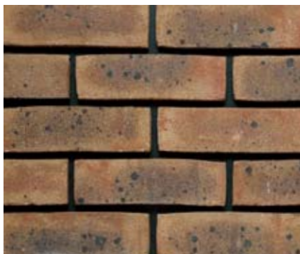
Capital Brown Multi Stock