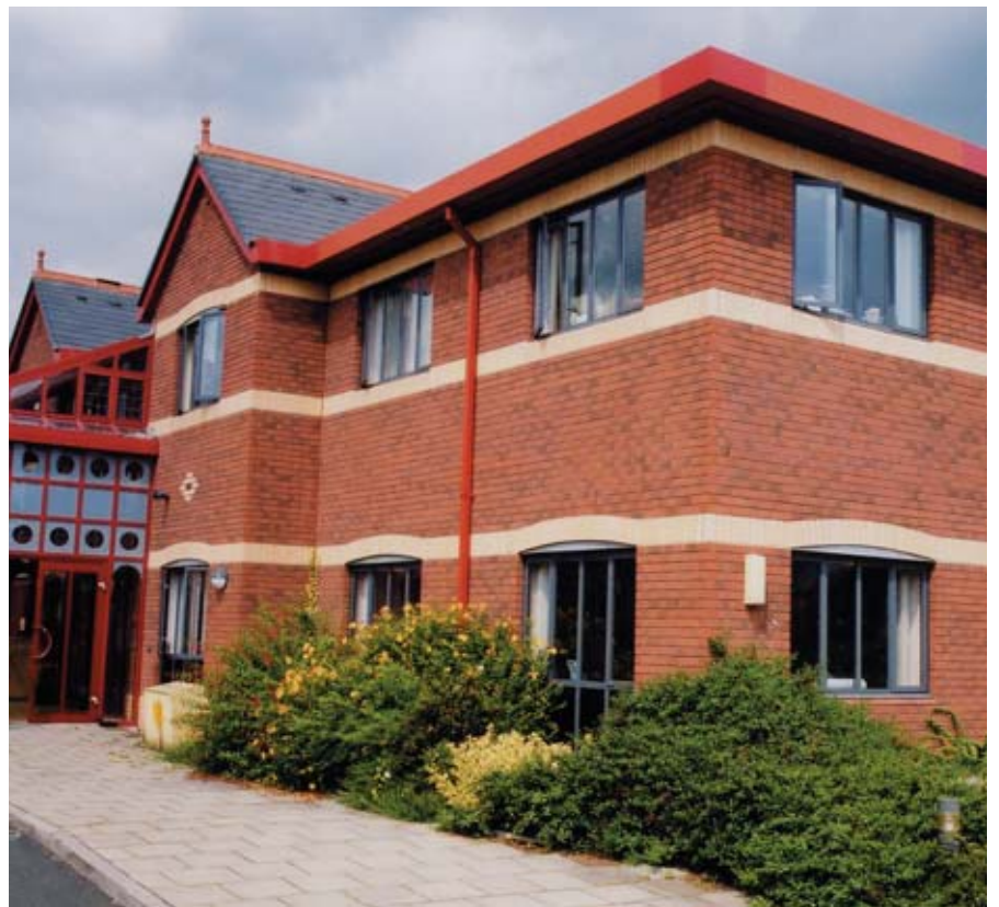
Health Centre, Exeter, Devon | Isca Brown Blend