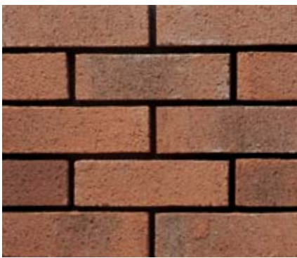
Westbrick Isca Brown Blend