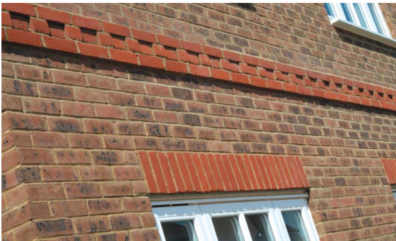
Private Housing, Maidstone, Kent | Capital Brown Multi Stock