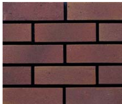
Tradesman™ Heather ●