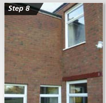
Reveal trims and extended sills are fitted as required.