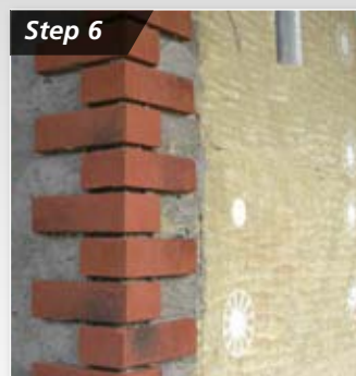
BrickShield® Special-shaped Clay Brick Slips are available for corners and reveals.