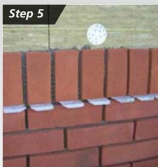
BrickShield® Spacers can be used temporarily until the mortar sets.