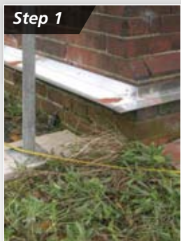
Step 1 Fix starter channel. Capping trims are also available.