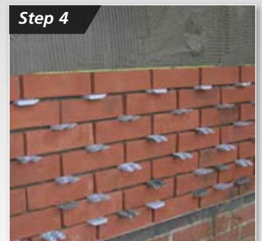
Step 4 BrickShield® Adhesive Mortar is then applied to the surface of the Rockwool® Façade Ultra. BrickShield® Natural Clay Brick Slips are laid onto the adhesive mortar, keeping to line and level for an even appearance.