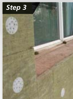
Step 3 Fix with BrickShield® Insulating Wall Anchors for ultimate durability.