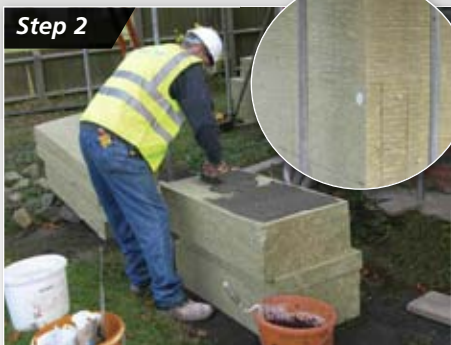
Step 2 Rockwool® Façade Ultra coated with BrickShield® Adhesive Mortar is then applied to sound, dry and smooth masonry.