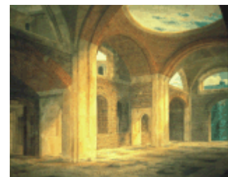
John Soane, Perspective view of the Consols Transfer Office, Bank of England, 1798.